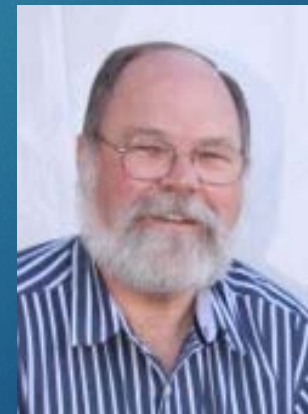
T e d