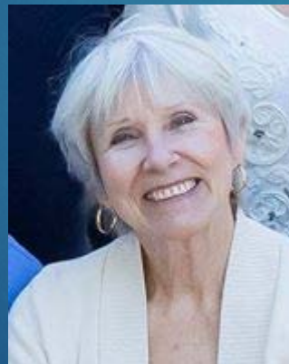
S a n d y